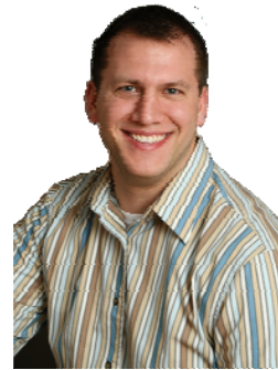
Jed Manders Minister of Youth & Family